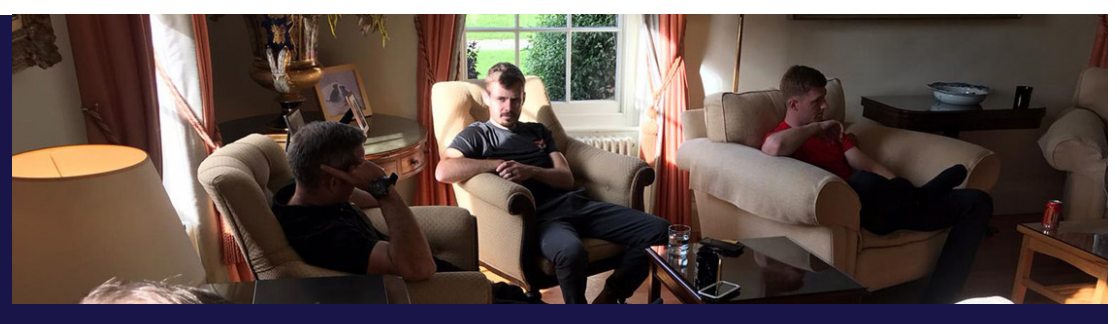
The RNRMC works closely with organisations to support the recovery of wounded, injured and sick.

An art therapy session to aid the recovery of somone from illness or injury