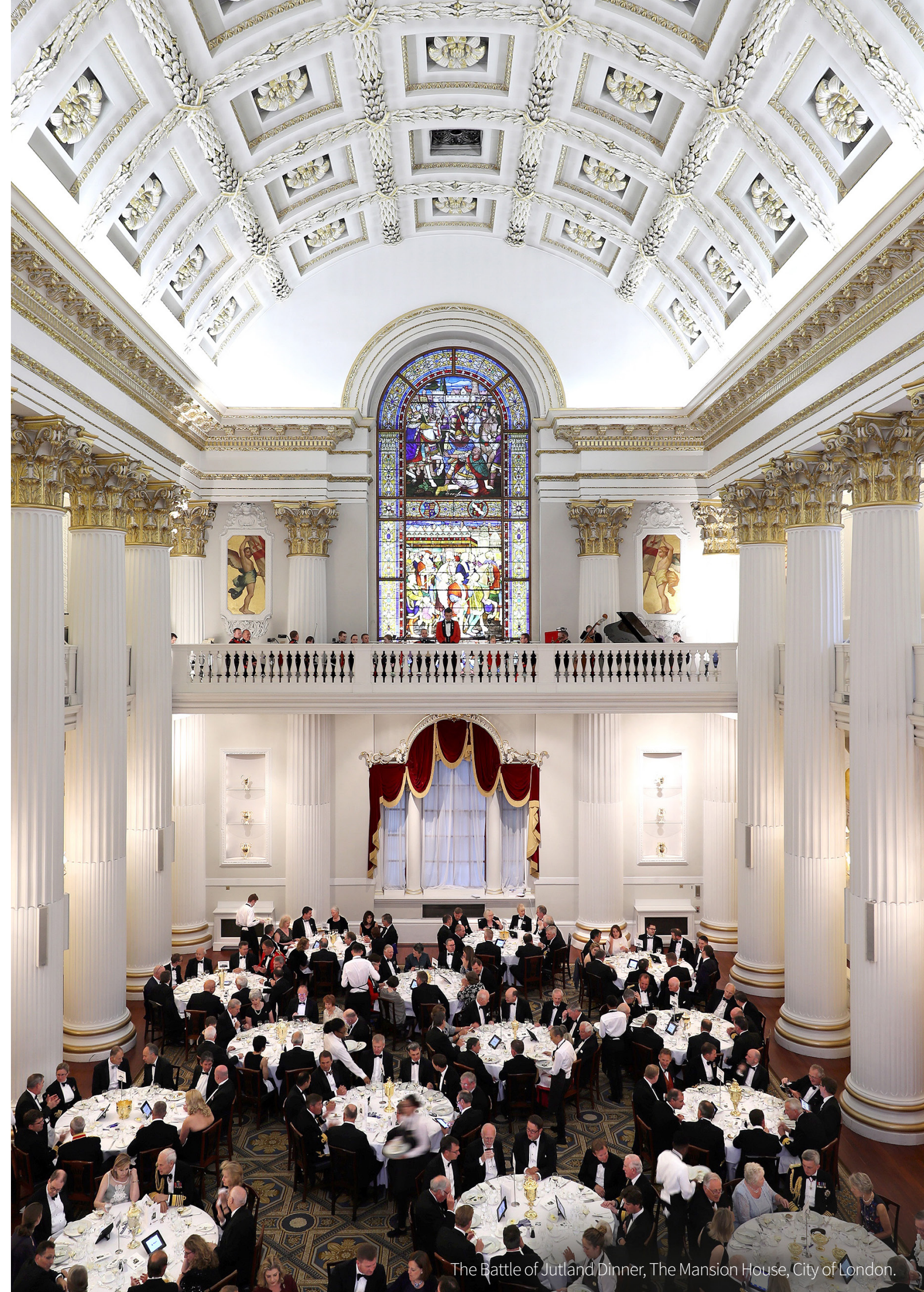
The Battle of Jutland Dinner, The Mansion House, City of London.

*VAT to be charged on all partnerships. All partnerships are 12 months. *Engagement opportunities may vary throughout the year.