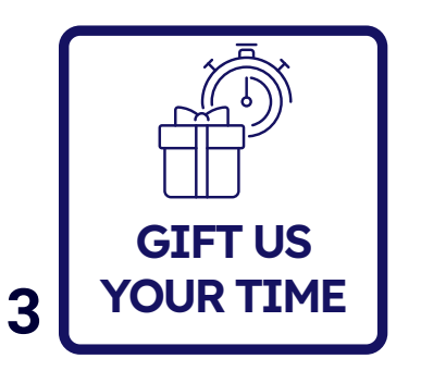
Events, stalls, open days - you name it. Get involved and volunteer for the RNRMC.