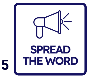
Share, Tweet and tag us on social media! Help us spread the word.